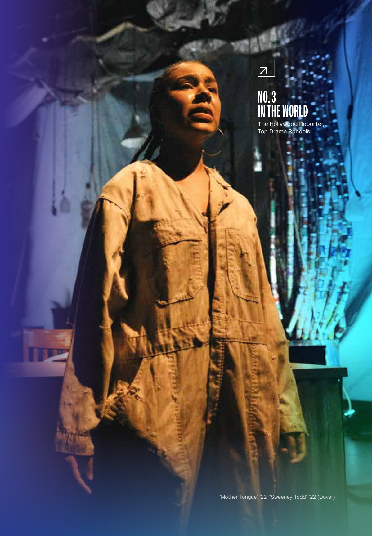
"Mother Tongue" '22; "Sweeney Todd" '22 (Cover)

The Hollywood Reporter, Top Drama Schools